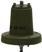
HF NATO antenna base whip