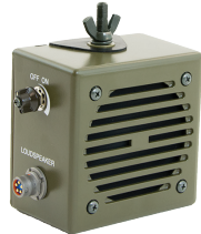
H-250 Remote Speaker