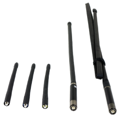
Long, medium and short antennas