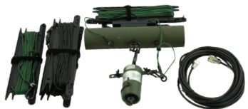
Tactical broadband antenna