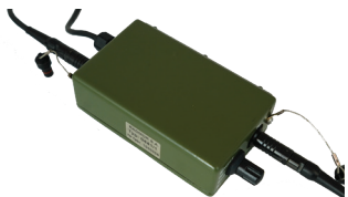
6150 family to 6160 family cross frequency interoperability