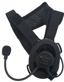
Single ear headset