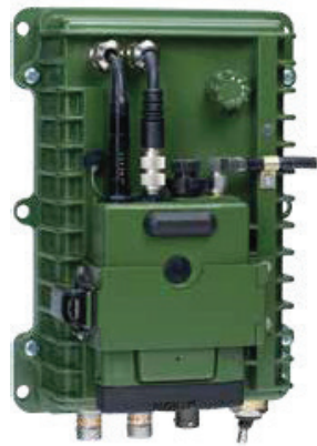
6160-PR mobil docking station