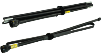
Tape and collapsible whip