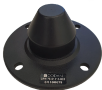
Vehicular dome antenna