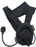
Single ear headset

Codan’s RF and software engineering teams can collaborate with client engineers to design bespoke sovereign modes and waveforms according to specific end-user requirements.