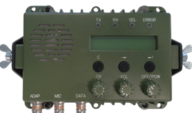
Console (mobile use)